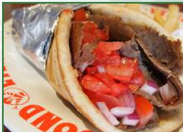
GYRO on Pita