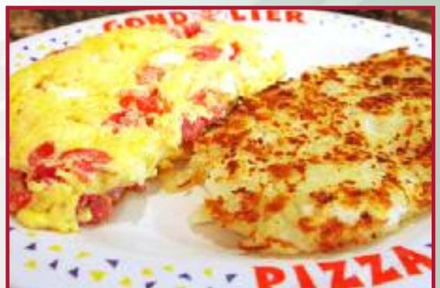
GREEK NO. 1

VEGETARIAN , Mushrooms, Spinach, Broccoli, Red Peppers & Three Cheeses 8.99