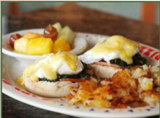
EGGS BENEDICT FLORENTINE

EYE OPENER Four Silver Dollar Pancakes, Two Eggs & Two Slices of Bacon 7.99